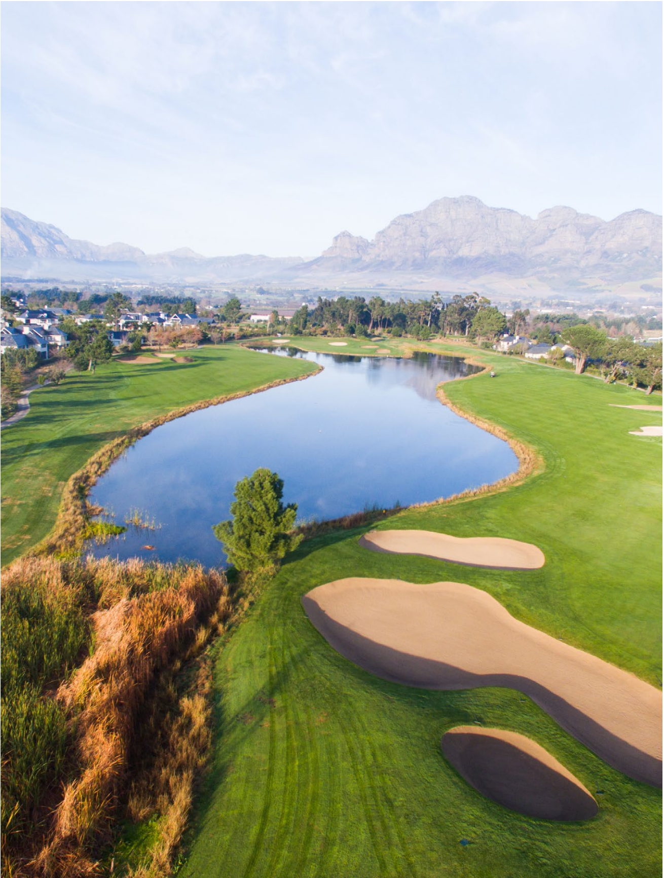
Pearl Valley Golf Course

* Golf course selection in Cape Town and in the Cape Winelands to be confirmed.