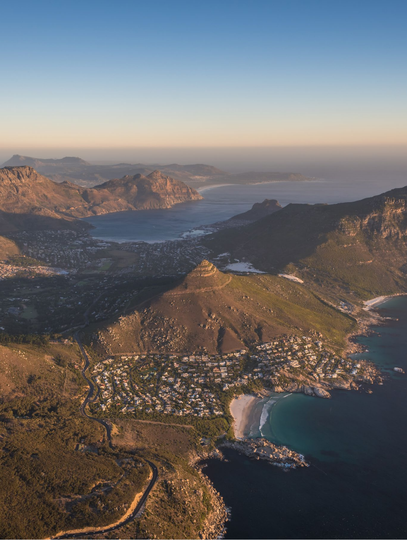
The Cape Peninsula

Explore the striking scenery as we circumnavigate the Cape Peninsula along one of the most scenic roads in the country known as Chapman’s Peak Drive. Rugged rocks and sheer cliffs towering more than 200 metres above the sea cutting deep into the ocean, provide a spectacular background for the park’s rich bio-diversity. With towering stone cliffs, endemic fynbos, breathtaking bays, beaches and rolling green hills and valleys, it’s definitely worth adding to your Cape Town bucket list. Stop for lunch and to visit the resident Jackass Penguin colony at the nearby Boulders Beach, one of the beautiful beaches on the peninsula with its big granite boulders and azure waters.