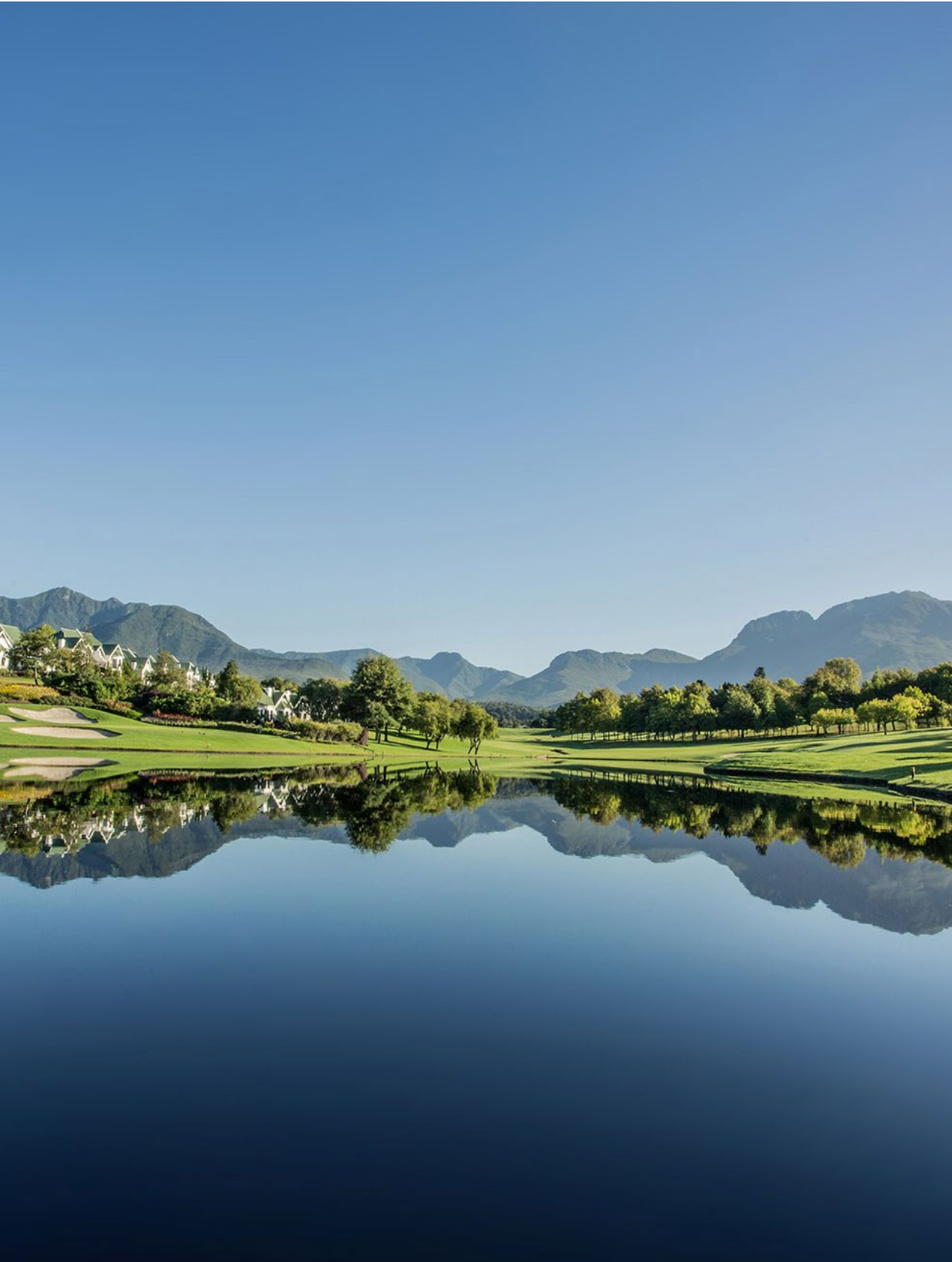
Fancourt's Montagu Golf Course

Fancourt's Montagu Golf Course, originally designed by Gary Player, has earned a world class reputation as one of the finest 18-hole parkland layouts. It holds the prestigious 5th position on South Africa's Top 100 Courses' list of top golf courses in the country. This tree-lined course covers large tracts of varying terrain across an undulating indigenous landscape.