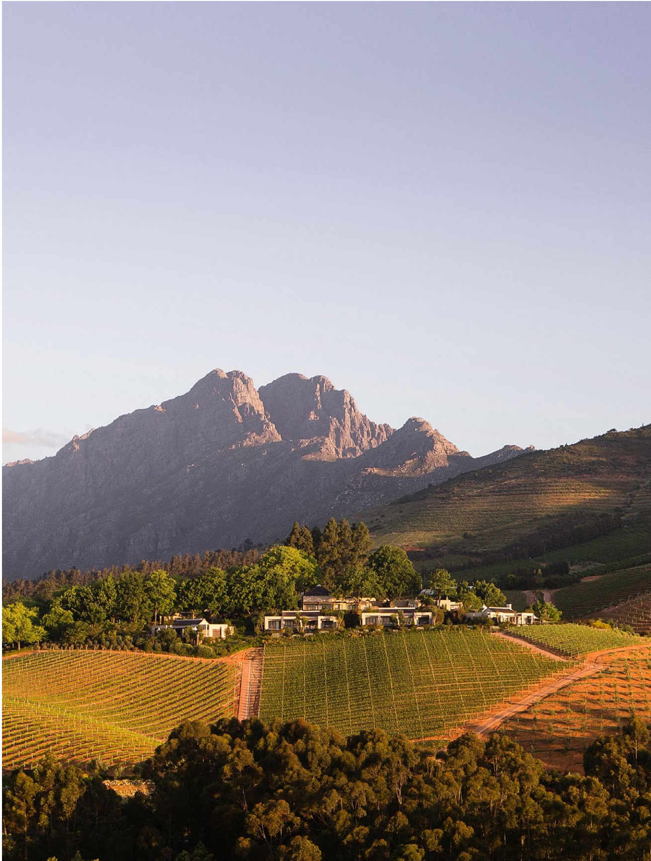
The picturesque Cape Winelands