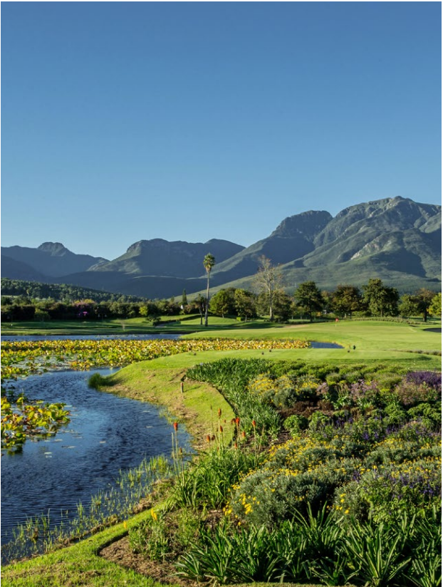
Fancourt's Outeniqua Golf Course

Ranked number 23 in South Africa, Fancourt's Outeniqua golf course presents an 18-hole parkland layout that is tailored to provide a laid-back golfing experience. The golf course offers a more relenting layout than its counterpart, the Montagu, but it presents a fair share of challenges and water hazards on as many as 11 of its holes. Designed by Gary Player and named after the mountain range that forms its breath-taking backdrop.