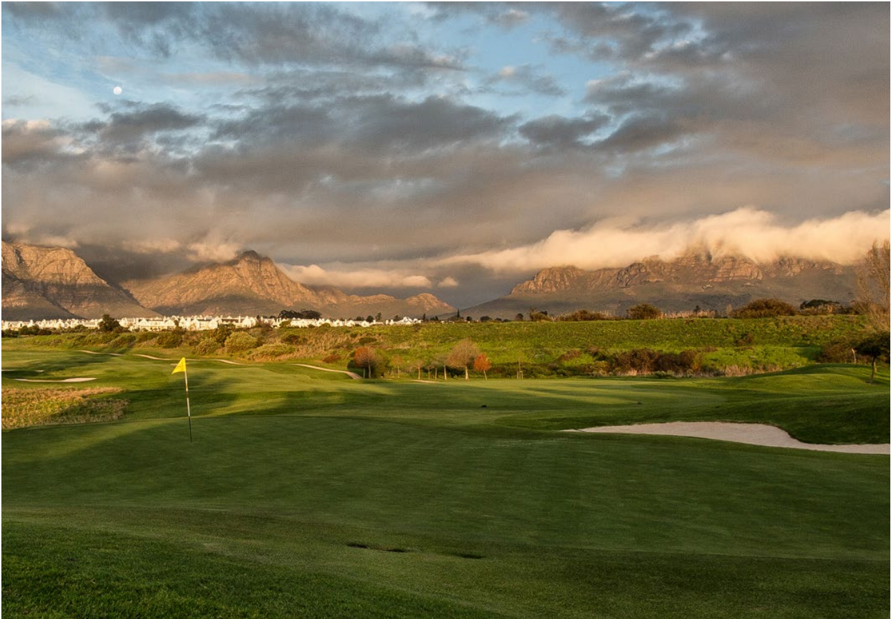
De Zalze Golf Course

The Cape Winelands offers a sublime golfing experience, with many prestigious golf courses set among picturesque vineyards and orchards, nestling in fertile valleys that are protected and nourished by towering and spectacular mountain ranges.